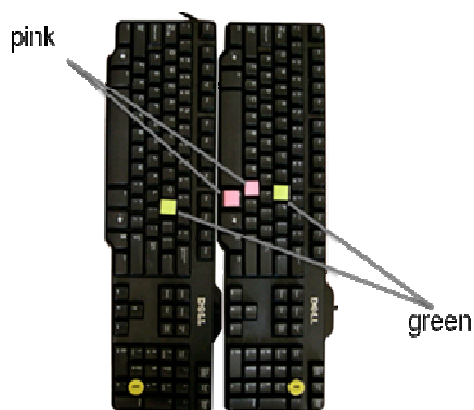
Figure 1. Configuration of keyboards to collect bimanual (green buttons) and unimanual (pink buttons) responses.

Participants performed a sentence meaningfulness judgment task. They were seated in front of a computer with two keyboards aligned side-by-side in front of them (as in Figure 1 below). They keyboards were oriented such that the long axis of the keyboards projected out directly in front of the participant, at their midline. Participants first pressed the yellow keys with their two thumbs to begin auditory presentation of a sentence – these are at the bottom of the image in Figure 1, and were on the edge of the keyboard closest to the participant. Once they decided whether the sentence made sense or not, they released the yellow buttons to press either the "Yes" or "No" buttons on the keyboard to indicate their decision. The response buttons were positioned to require the participant to use either both hands (the green buttons) or only their right hand (the pink buttons) to press the buttons. Participants were instructed to press the pink buttons with two fingers of their right hand and the green buttons with the index fingers of their two hands. We measured the Reaching Time – the time from the yellow-button release until the "Yes" or "No" button press, because we were interested in seeing if simulation of the socially expected action would influence subsequent motion execution.