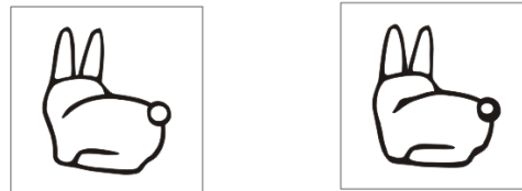
Easy rabbit/hard dog

We attempted to test our current predictions and further verify our previous findings by developing a new set of ambiguous drawings. We developed 3 pairs of asymmetrical drawings. Each pair contained an easy-to-see and a hard-to-see version of a particular picture. The first pair of ambiguous drawings can be seen as either a rabbit or a dog (figure 3). The two variants of this drawing included an easy-to-see rabbit (hence a hard-to-see dog) and an easy-to-see dog (hence a hard-to-see rabbit). The second ambiguous drawing can be seen as either a duck or a goat. The third drawing embodied a mouse and a frog and its two variants depicted an easy-to-see mouse (a hard-to-see frog) and an easy-to-see frog (a hard-to-see mouse).