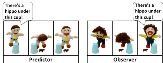
Figure 1: Procedure in Experiments 1-3. The “predictor” puppet first stated the contents of the cup, and then revealed them. The “observer” puppet first revealed the contents of the same cup, and then stated them.

Children’s understanding was evaluated via two test questions. Children were asked which puppet had peeked underneath all the cups before the beginning of the game. And children were asked which puppet would know what was under the third cup (which neither of the agents had interacted with). Question order was counterbalanced across participants. Finally, to ensure that they remembered each puppet’s role, children answered a memory check question: Children were asked which puppet had told them what was under the cup before he looked, and which puppet had told them what was under the cup after he looked. Only children who answered both parts of the question correctly were scored as having given the right answer. Because pilot work suggested that the check question was more linguistically demanding than the test questions, this question was not pre-registered as an inclusion measure. It was instead included as a potential variable of interest.